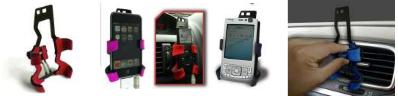
Ipod /Mobile car holder